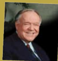
Kenneth E Hagin